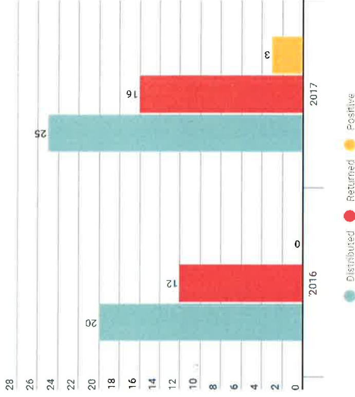
FIT Kits Distributed and Returned, 2016-2017